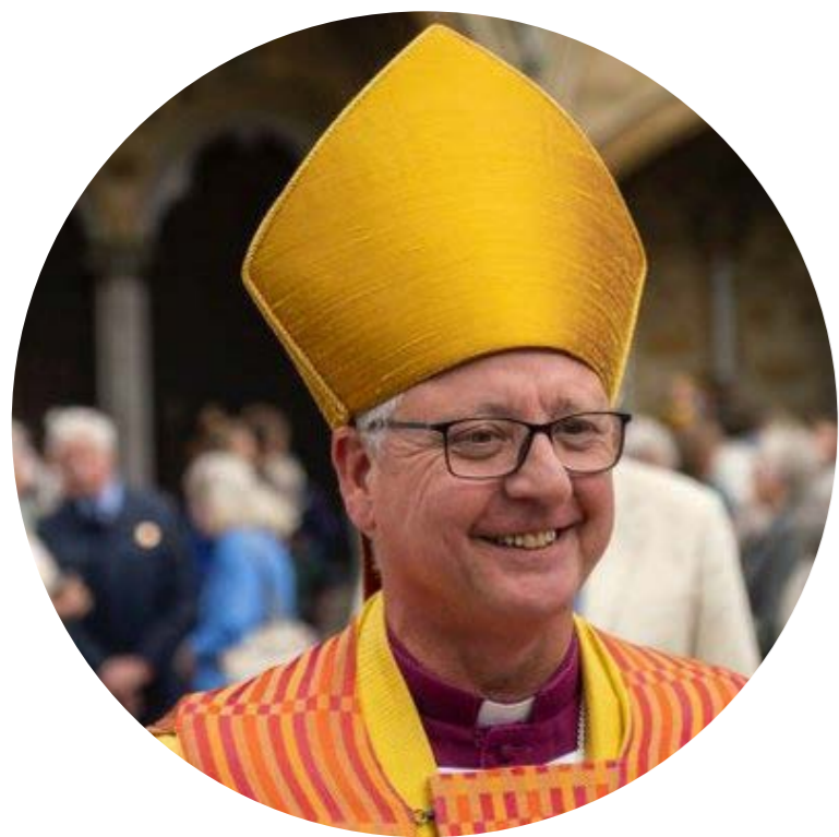
THE RT REVD STEPHEN LAKE

I pray for every blessing on us all in 2023.