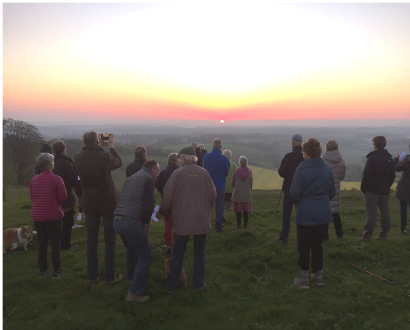
Easter Morning Sunrise Service (Martinsell Hill)

Our Vision is to see the Kingdom of God growing in the Vale of Pewsey