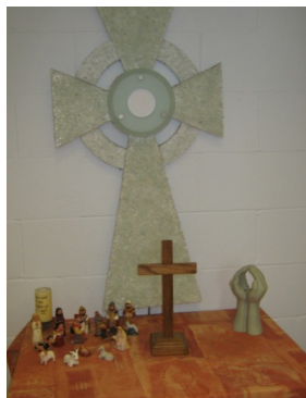
Trinity VA First, Verwood

Consider music to establish atmosphere and that supports the theme whenever possible. This can be whilst entering or leaving worship and/or during a time of reflection. Collective singing can be uplifting and if it also supports the theme, so much the better. This is also an opportunity for children who play instruments to engage and help lead.