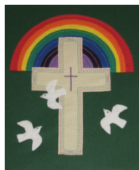
Broadwindsor VC Primary

As long as worship is held regularly (daily) how and when is not prescriptive. Some schools prefer to begin each day with worship whilst others hold it at other times of the day.