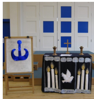
St Mary the Virgin VA Primary, Gillingham

These might include any of the following: cross; candle; flowers; artwork; colour (cloth to reflect the church year); natural object/s; an object relevant to worship that stimulates reflection; powerpoint slide pertinent to the theme.