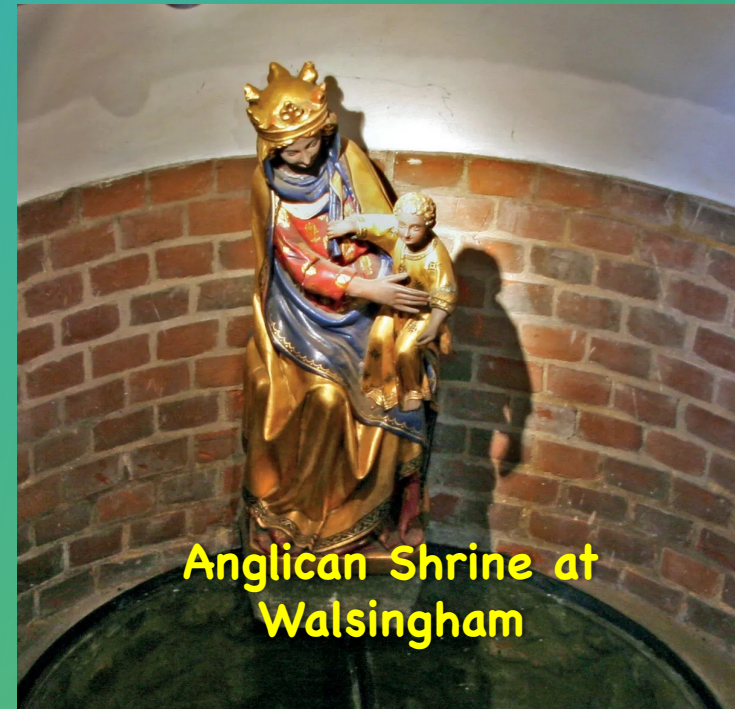
Anglican Shrine at Walsingham

For many years, our annual retreats have been held at either Hilfield Friary in Dorset, or Glastonbury Abbey House in Somerset, but for our 2025 retreat our Curate at the time led a joint parish retreat, with Holy Angels Lilliput, to Walsingham in Norfolk.