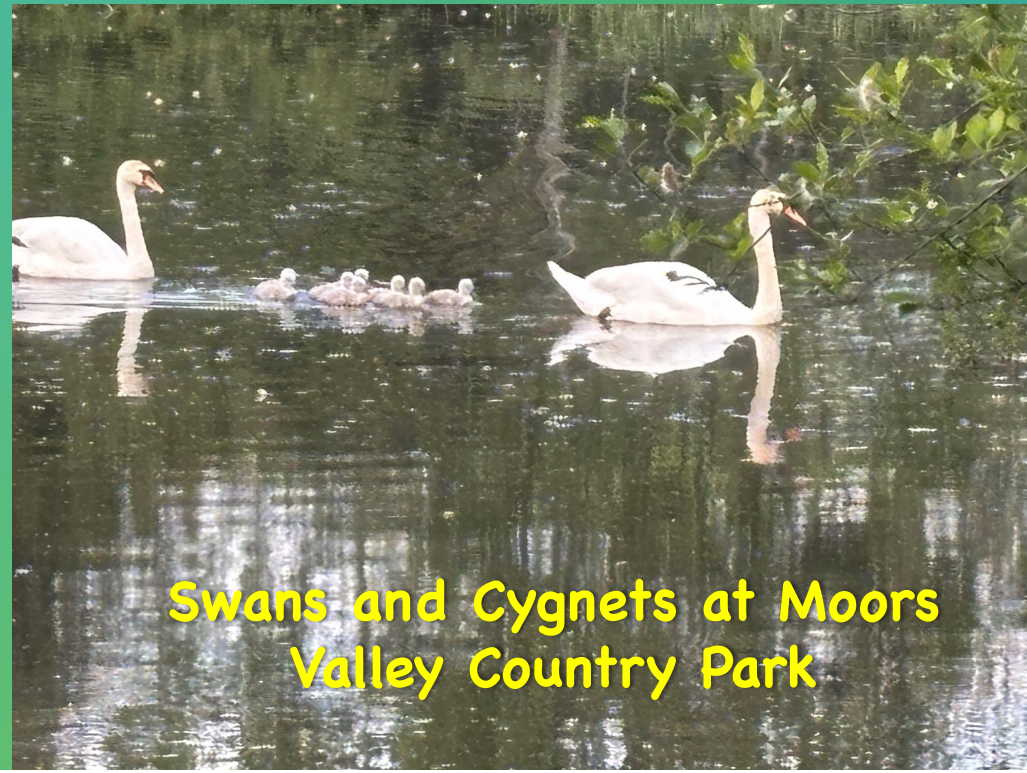
Swans and Cygnets at Moors Valley Country Park

“Verwood is a wonderful place to live and work. With the New Forest on the doorstep and the coast within thirty minutes drive it is an example of God’s wonderful creation.”