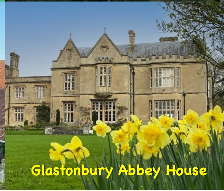
Glastonbury Abbey House