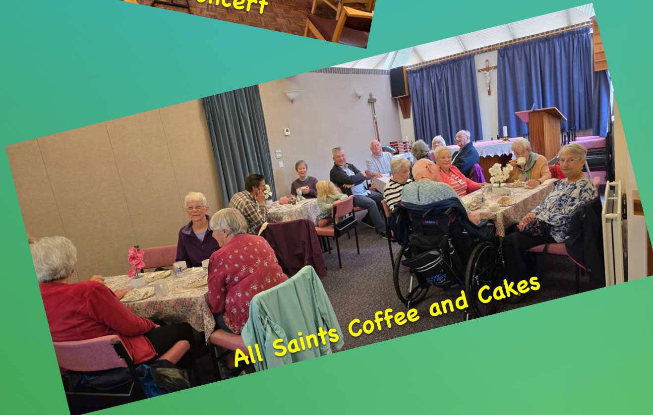
All Saints Coffee and Cakes