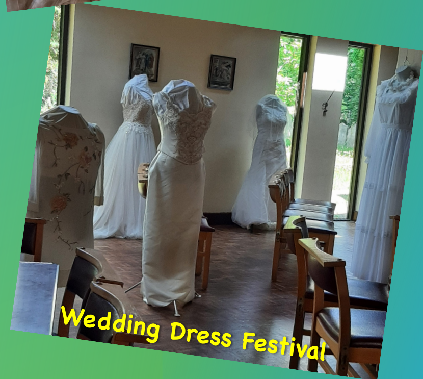
Wedding Dress Festival