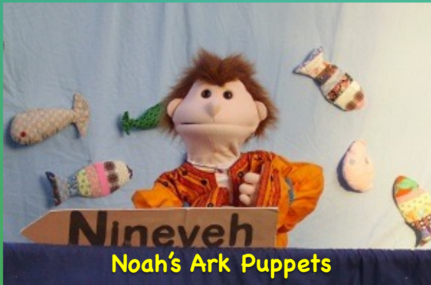
Noah's Ark Puppets