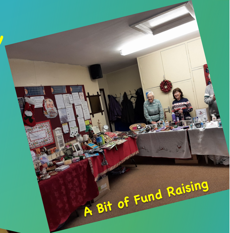
A Bit of Fund Raising