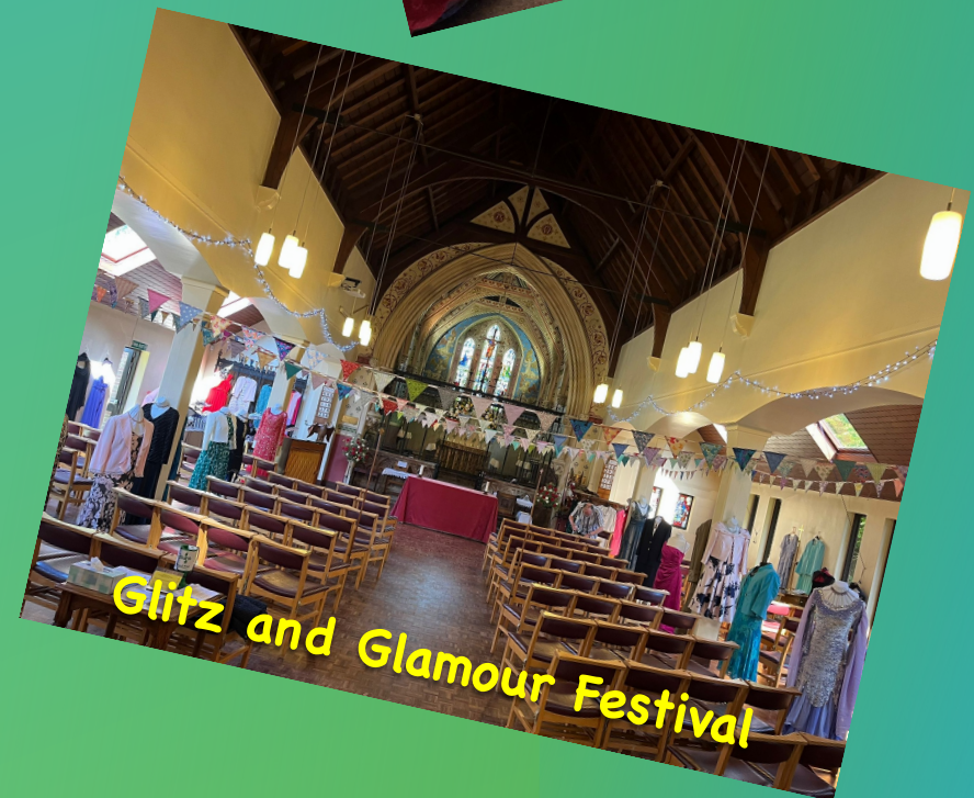
Glitz and Glamour Festival