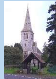
Milton on Stour