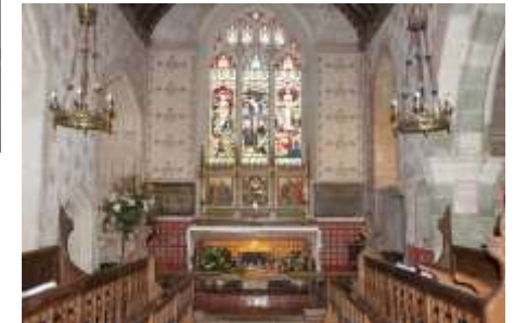
Altar with Christmas Nativity scene

The church which is Grade I listed is well maintained – recent work has included repairs to the plaster ceiling undertaken in mid-2023, enabled via generous grant funding from Dorset Historic Churches Trust, Erskine Muton Trust and Society of Friends of Silton (SOFOS).