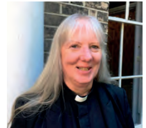
The Venerable Penny Sayer Archdeacon of Sherborne